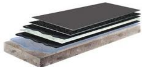
BAUDER AP3 PROTECTION LAYER (LOOSE LAID OVER AP1 LAYER)