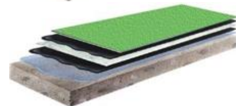
BAUDER AP2 ROOT RESISTANT PROTECTION LAYER