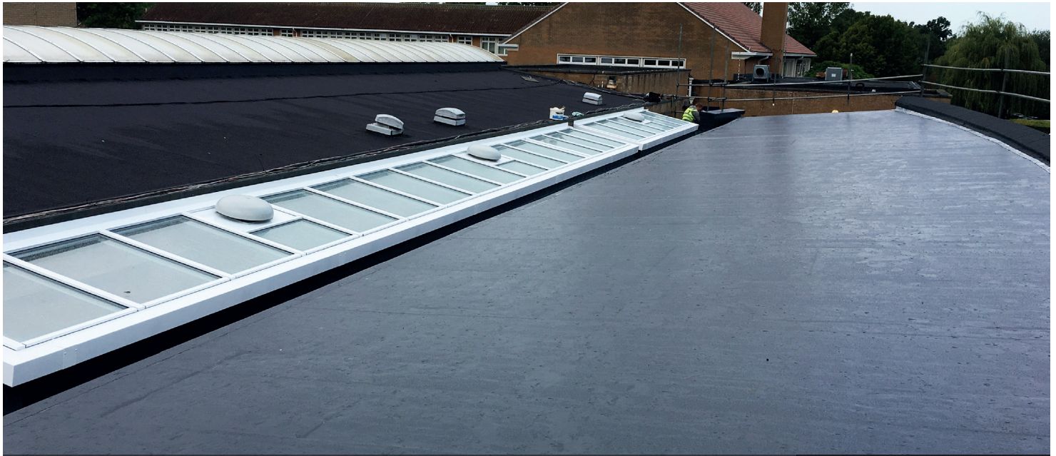
George Abbot School